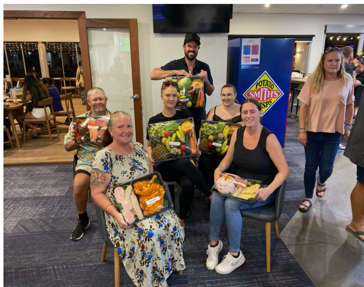
The 5 lucky Social Members who benefitted from Knuckles's good will.

The club will welcome Knuckles back next year—Members probably won't.