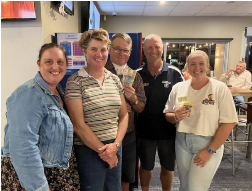
Congratulations to our FIVE April Birthday Winners, each walking away with $100 CASH!

Our Birthday Cash Draw is drawn the last Wednesday of the month, after the Wednesday Night Badge Draw, during Trivia!