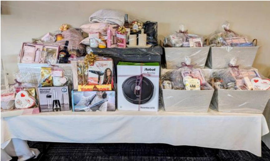
The Prizes for our members to win on Mother's Day!

We will be having our regular Meat Tray Raffle. 20 Trays from our local favorite butcher and as it is a special day just for mum, we will be adding in fresh flower bouquets into this raffle. Tickets for the raffle will go on sale at 12 midday and will be drawn at 1.30pm. Our Mothers Day Prizes which are on display at the bar will be drawn after the raffle at around 2pm. You get a ticket into this draw every time you make a purchase at the bar! As there is only 10 prizes and we would love to spread them around as much as possible so you can only win 1 prize per person.