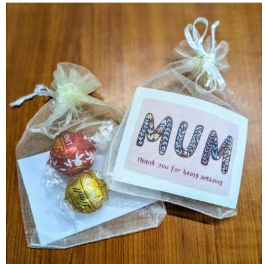
The small gift for our dining mums!