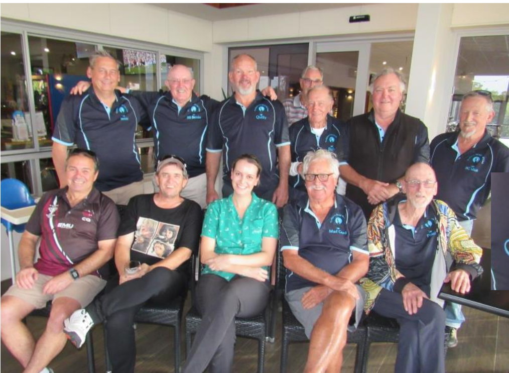
Pictured, The popular members of the Tyalgum Social Golf Club with mascot centered!