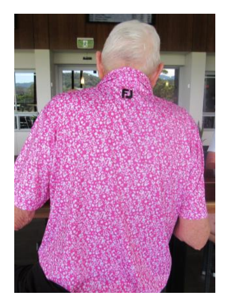
Outstanding shirt of the month! What style!