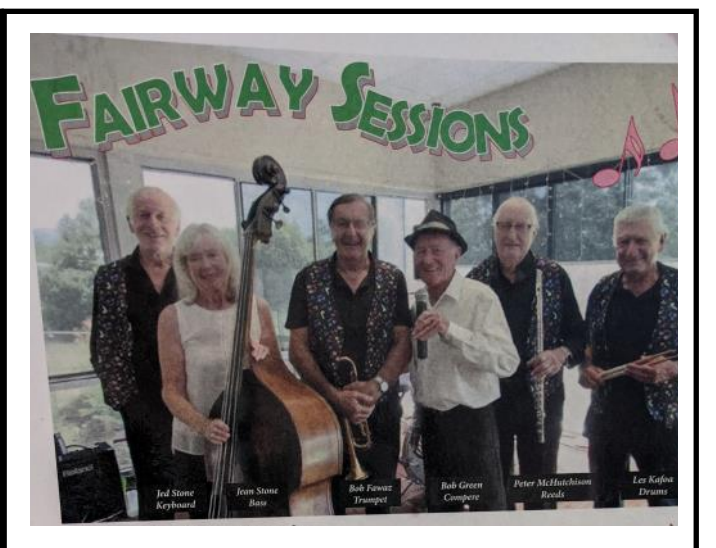
Due to Christmas Day, Fairway Sessions will Only be returning on January 22nd 2023, 1-4pm