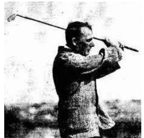
NOTE HIS GRIP!!!!