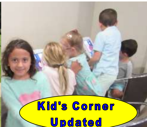
Kid's Corner Updated