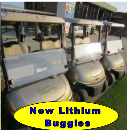
New Lithium Buggies