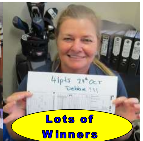
Lots of Winners