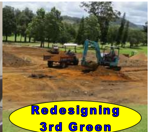
Redesigning 3rd Green