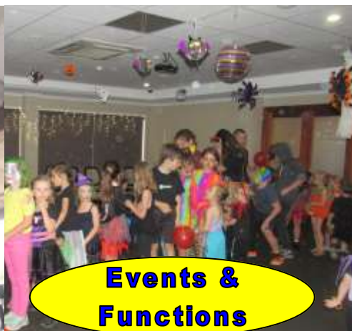
Events & Functions